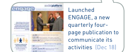
Launched ENGAGE, a new quarterly four-page publication to communicate its activities (Dec 18)