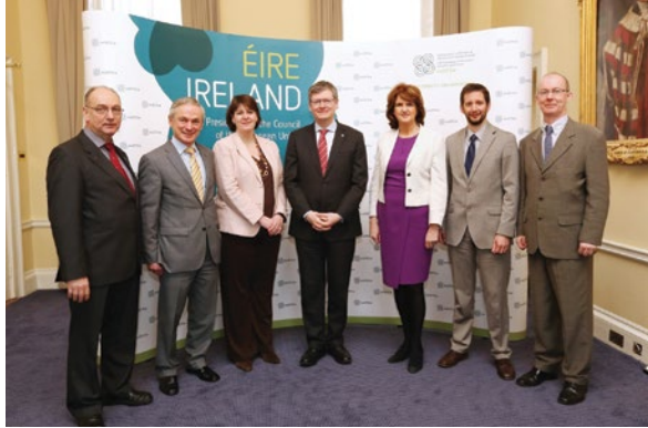
Irish EU Presidency informal EPSCO Council

(NEETs). This was a minimum requirement to begin to rebalance the economic and financial dimension of the EMU with a genuine social dimension. The aim of the Scoreboard is to serve as an analytical tool for identifying major employment and social problems. Our call for developing social standards for upwards social convergence was also explicitly reflected in the position of the European Parliament on the Social Dimension of the EMU.